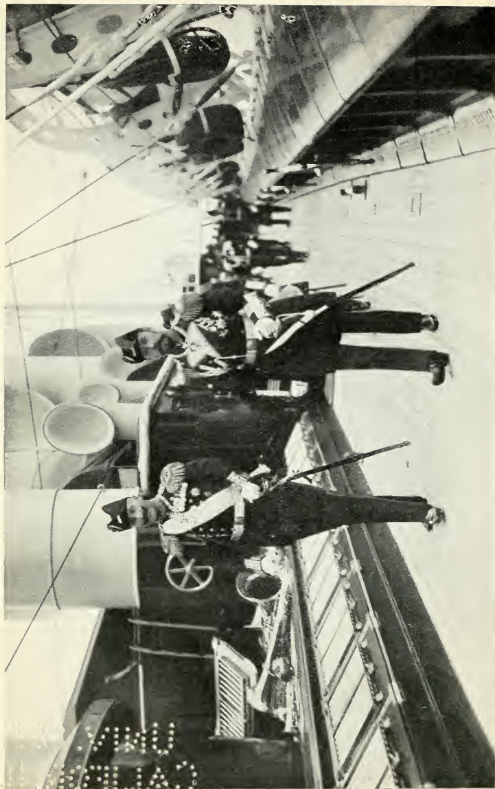
The two Emperors on board the "Standart."